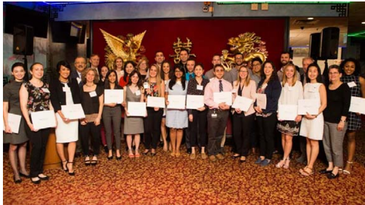
TUSDM's Class of 2018 Honos Civicus Inductees

Launched by Tisch College in 2009, the Honos Civicus Society selects and acknowledges graduating students who engaged in meaningful service and leadership activities during their time at Tufts. Available to undergraduates and graduates at all Tufts schools, Honos Civicus provides an opportunity to celebrate and reflect on a Tufts education's foundational commitment to social impact and to join a network of engaged alumni who share and acted on that commitment.